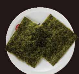
Nori[Sea weed] $1.50