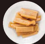
Menma[Bamboo shoots] $1.50